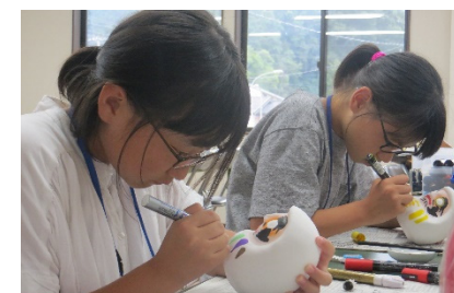
Reporters painting Darumas