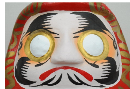
Good luck charms on the face

Shirakawa Daruma has a history spanning 300 years. It is said that Daruma doll production started in the Edo era, when the domain's lord Matsudaira Sadanobu had the artist Buncho Tani draw an image of Daruma.